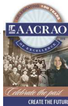
AACRAO is celebrating 100 years of Excellence, join the celebration in New Orleans, April 21-24, 2009

Start making your plans now to attend AACRAO's 96th Annual Meeting in New Orleans , April 21-24, 2010. This meeting marks a mile-